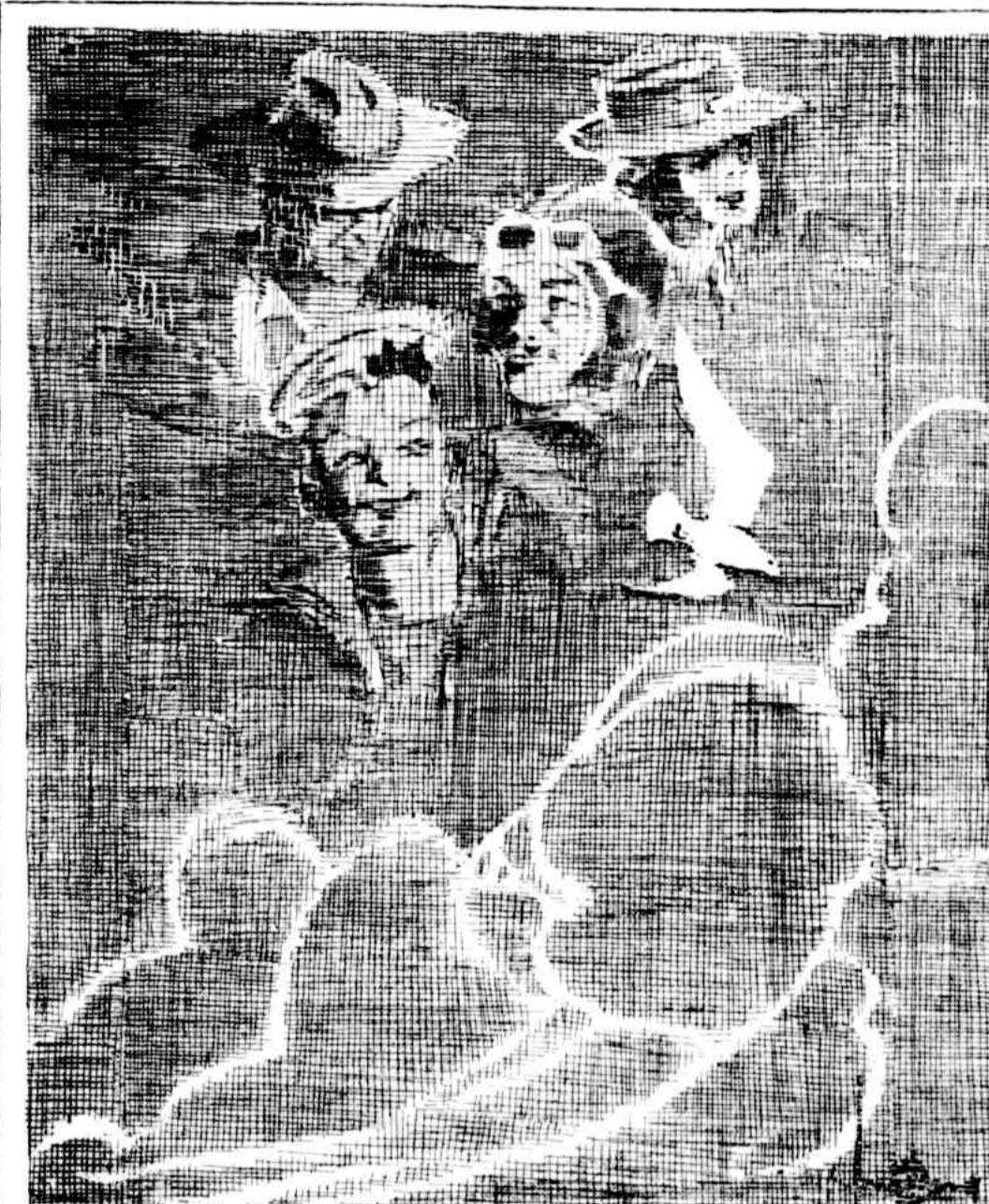
"They live on far away, without visible symbol, woven into the stuff of other men's lives." — PERICLES.

gain such prestige and authority that the Dominion Parliaments would be willing to take its advice. The newspapers concerned pointedly base the suggestion on questions which some reporters put to Mr Nash, NZ Deputy Prime Minister, at a Press conference. Mr Nash dismissed the proposal as "not practical politics." It was authoritatively stated