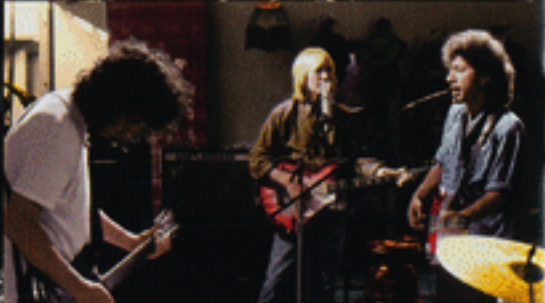
Top: Photo session for Echo cover 1999. Bottom: In the studio 1990s.