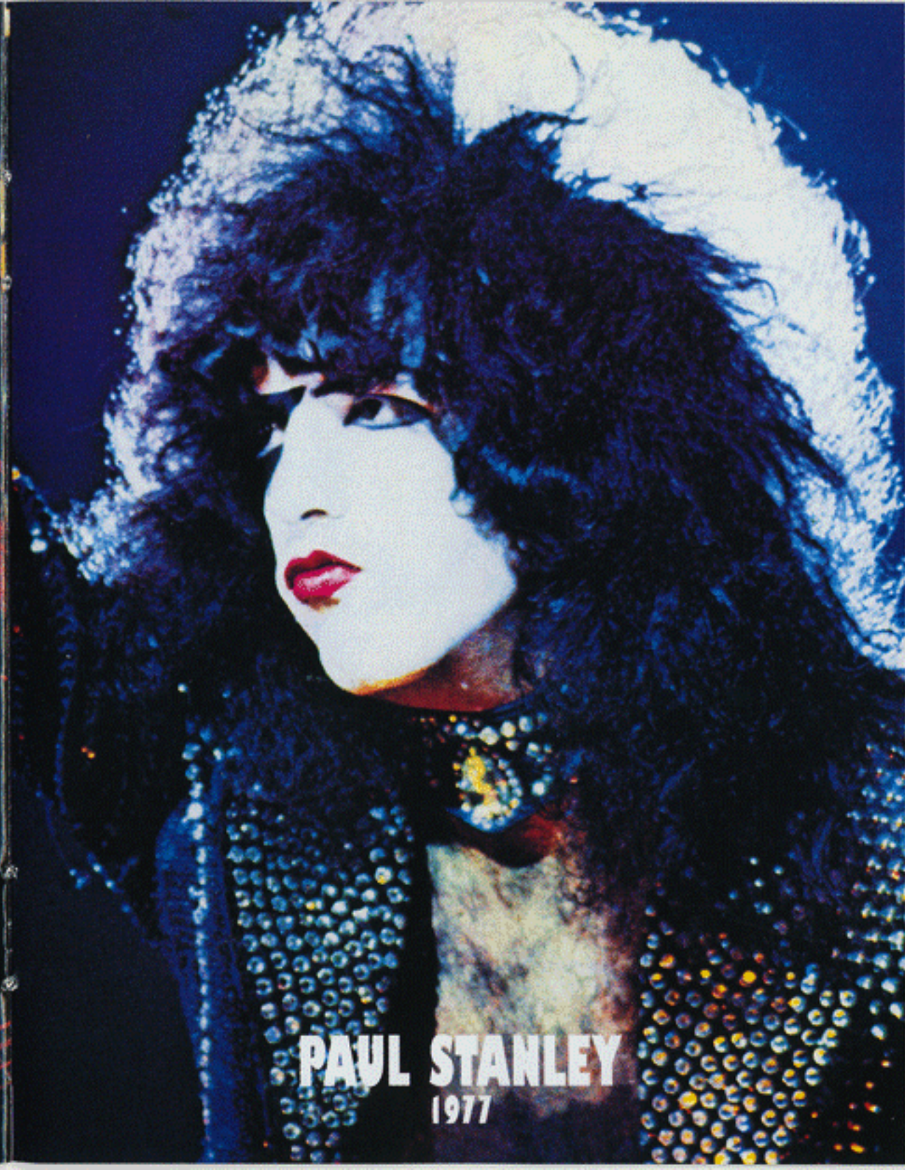
PAUL STANLEY 1977