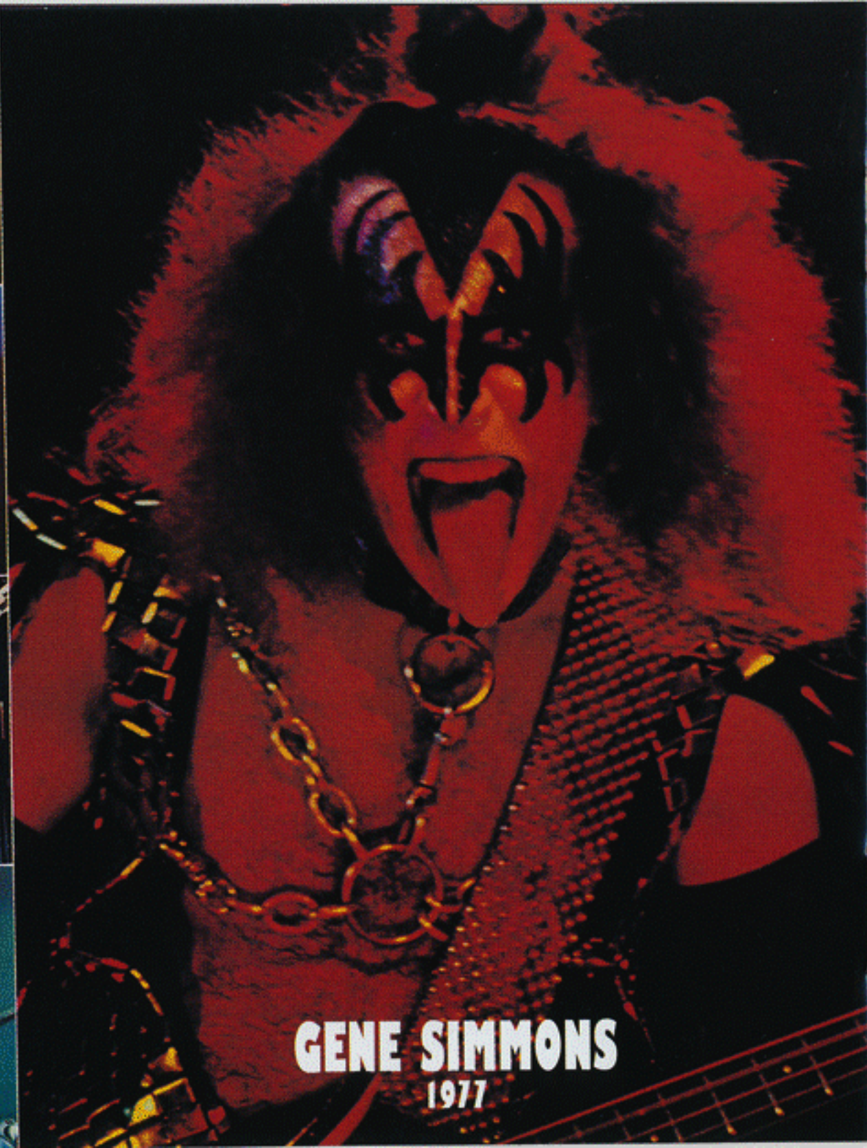
GENE SIMMONS 1977